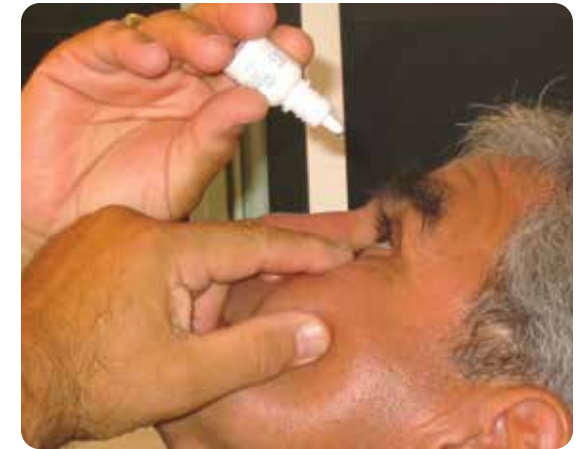
Artificial tears or steroid eye drops may help relieve redness, swelling or dry eye from blepharitis.

Antibiotics. Your ophthalmologist may have you use an antibiotic ointment on your eyes. Put a small amount of ointment on a clean fingertip or a cotton swab (Q-tip). Gently apply the ointment to the base of your eyelashes. Do this just before bedtime, or as your doctor recommends. Your doctor might also prescribe an antibiotic medicine for you to take by mouth.