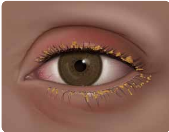
With some types of blepharitis, the eyelids become coated with oily particles and bacteria near the base of the eyelashes.

Blepharitis is inflammation of the eyelids. They may appear red, swollen, or feel like they are burning or sore. You may have flakes or oily particles (crusts) wrapped at the base of your eyelashes too. Blepharitis is very common, especially among people who have oily skin, dandruff or rosacea.